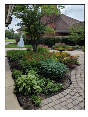
Peace Village 10300 Village Circle Drive