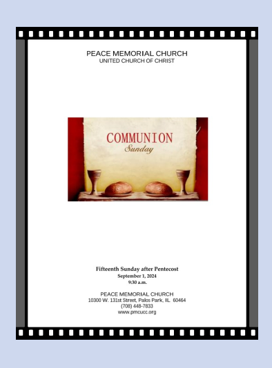
Bulletin for Sunday, September 1, 2024

Being the church recognizes the value of people who attend in person or online - and the people who will never attend in any way at allBeing the church recognizes the value of people who are deconstructing their faith and don't have any plans to start any kind of building back up at all.